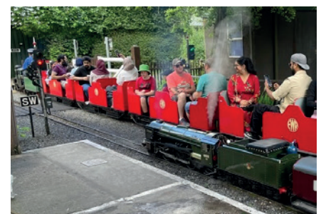
Another happy group depart the station