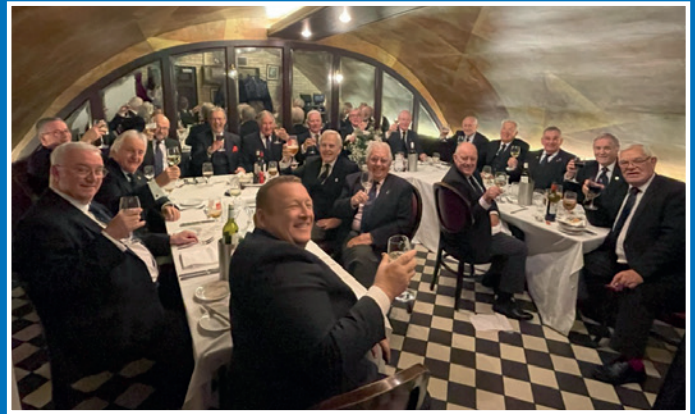
Companions enjoying a festive board