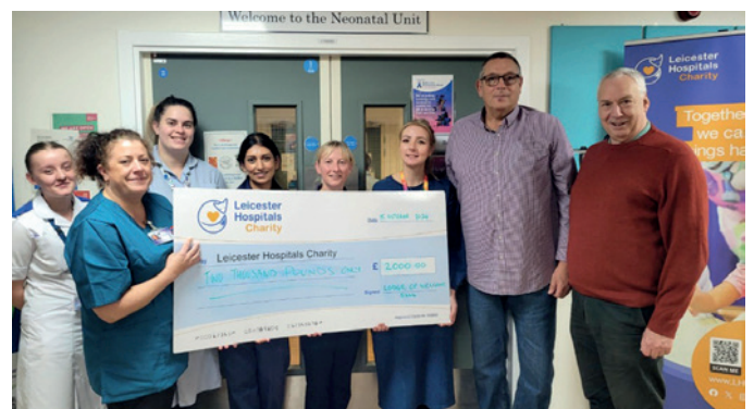
XXXXXXXXXX XXXX XXXXXXXX XXXXXXXX XXXXXXXX

Standing orders are generating regular monthly income and the Lodge moved into the new masonic year it was carrying a healthy surplus forward. Congratulations to all involved in these wonderful achievements and the Lodge of Welcome is really a beacon of giving back and making an impact.