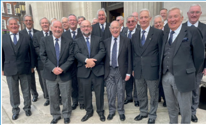
Companions at Freemason's Hall London

Afterwards, 18 of the Companions dined together at Totton's in Covent Garden, a convivial way to round off a great day.